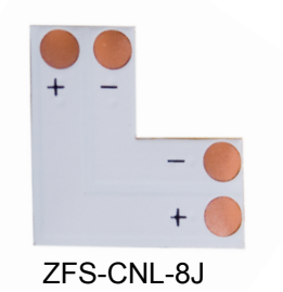
15.9mm (.63") 8.0mm (.32) 16.2mm (.64") - 8.0mm (.32")